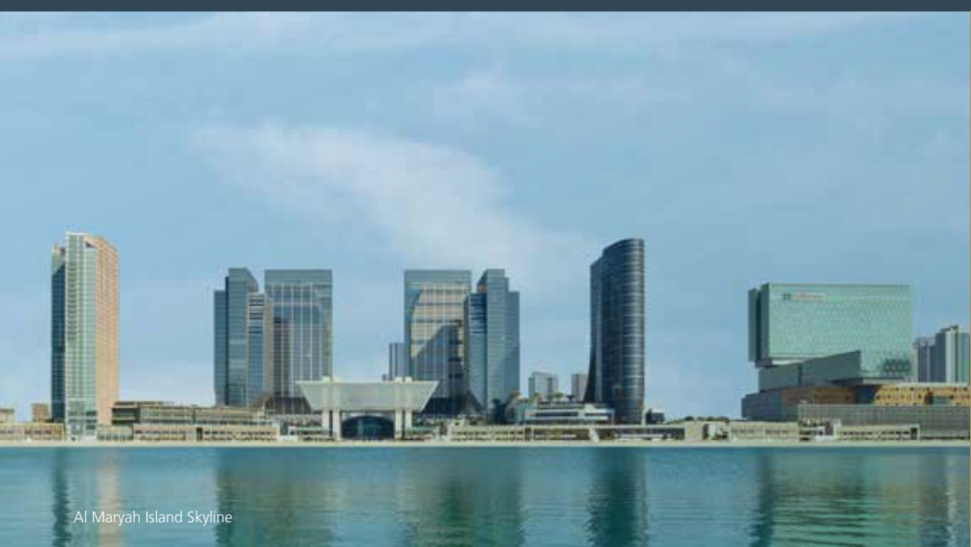
Al Maryah Island Skyline